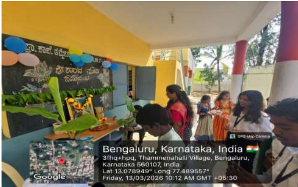
Preparation for Sharada Pooja during the inauguration of the ISR programme.