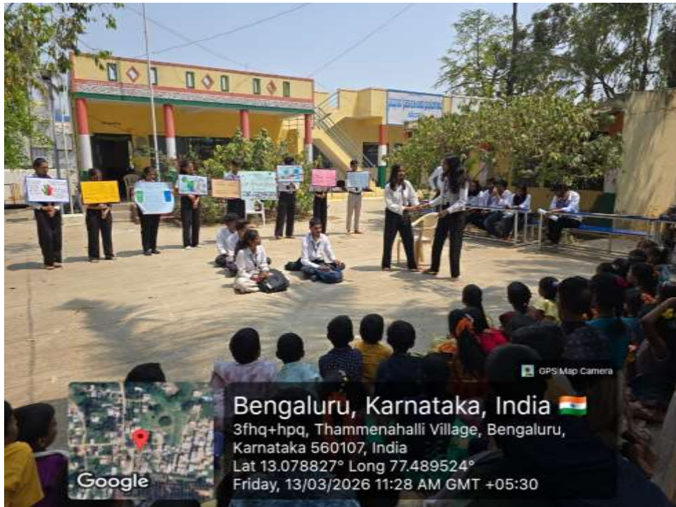
II semester students performing a skit on environmental awareness