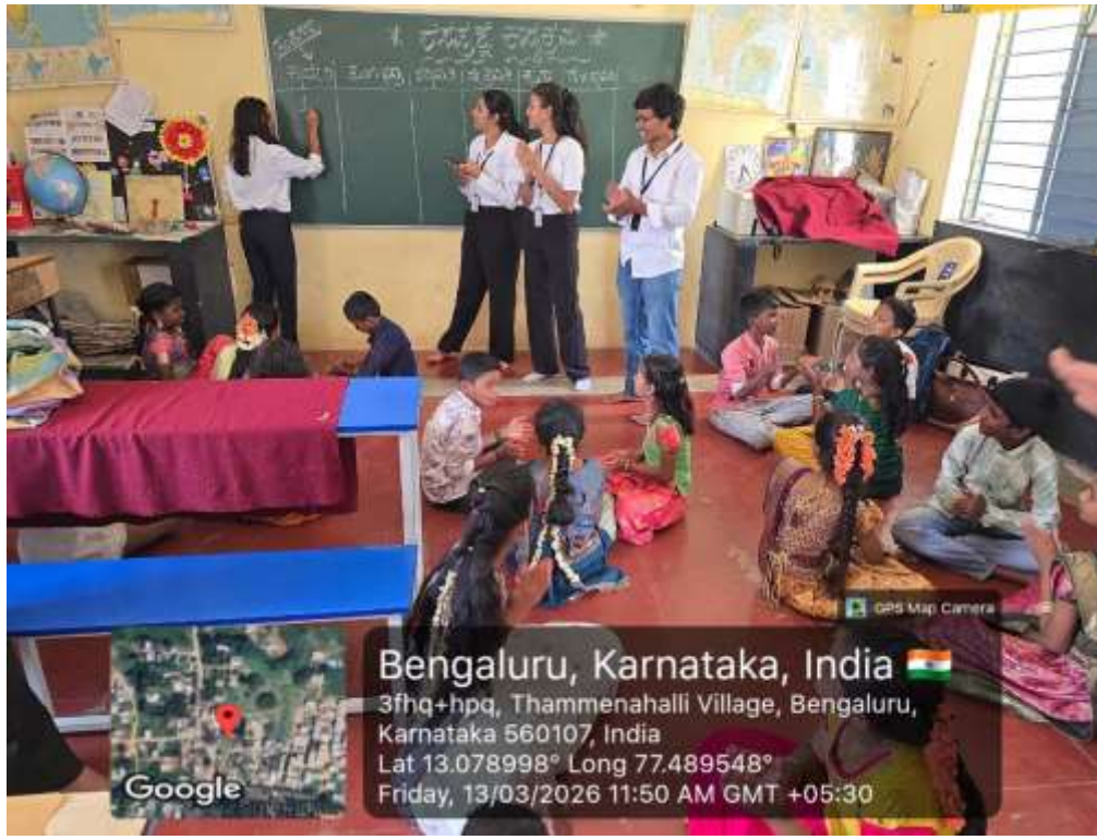
Quiz Competition to 5 th standard students