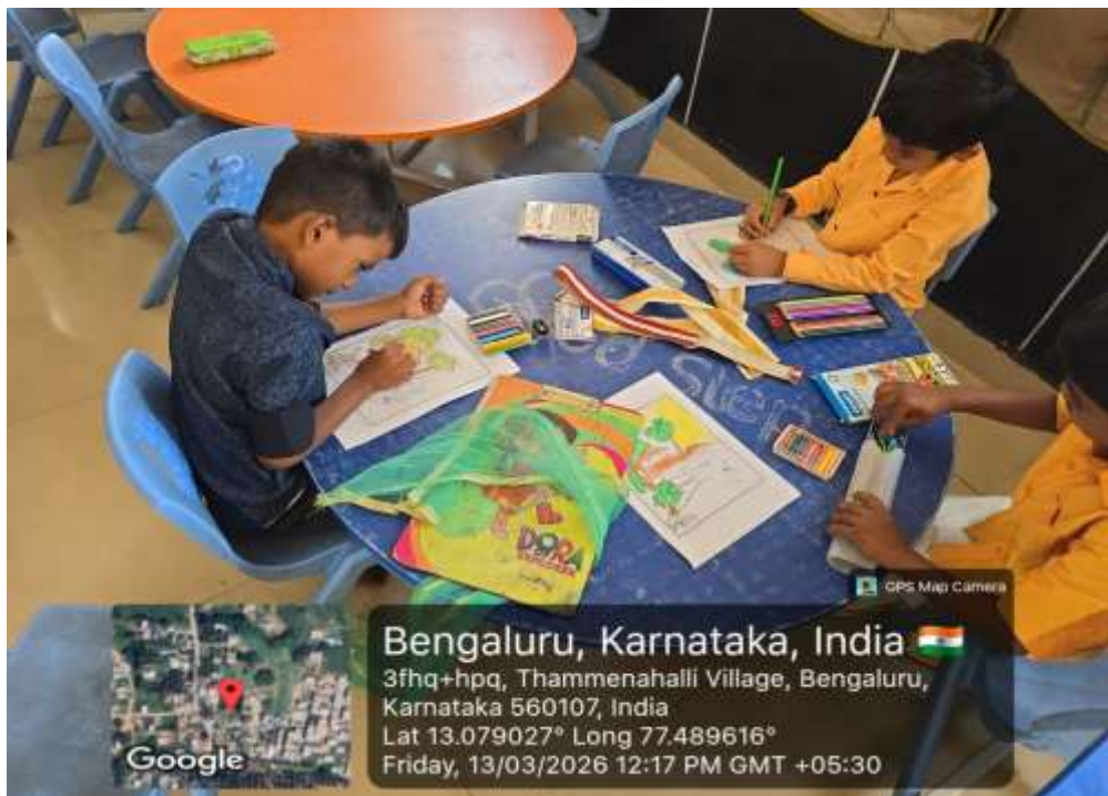
Colouring Competition to 1 st Standard students