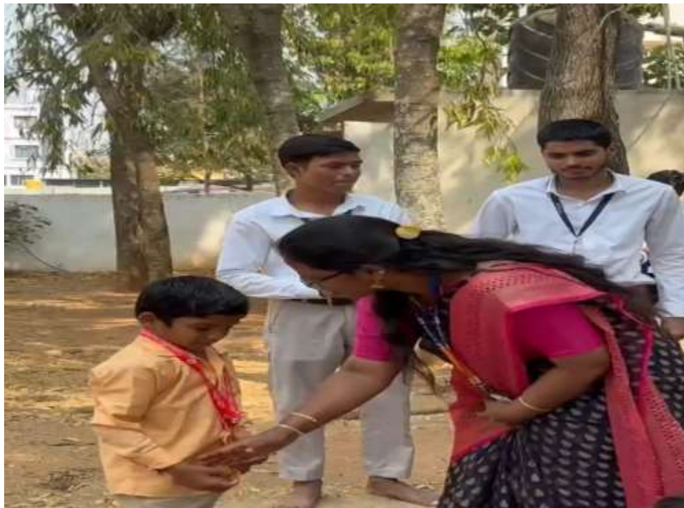
Awarded and appreciated gold and silver medal to Students